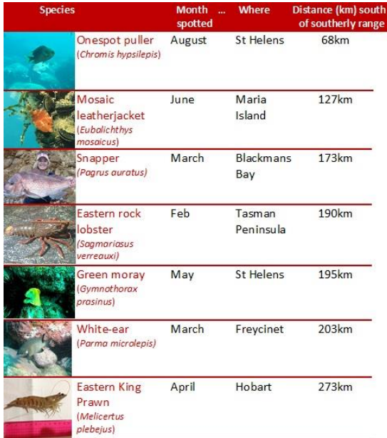
Table 4. Examples of sightings submitted to Redmap Tasmania that were ‘out-of-range’ i.e. south of their expected distributions

level of confidence in potential range extensions in Tasmanian species was estimated (Robinson et al. in press) and information on the raw data that is submitted to Redmap shows some individual sightings logged in Tasmania (Figure 1) and how far south they were spotted from their usual poleward range boundary (Table 1). Some observations are clearly significant: for example, the juvenile mosaic leatherjacket ( Eubalichthys mosaicus ) spotted off Maria Island by Redmap member Antonia Cooper in June this year (Plate 2). This species is not normally found in southern Tasmania in mid-winter. Juveniles of potential range-extending species recorded in colder months are particularly important as they indicate the prospect of species being able to survive (and therefore reproduce) throughout the year, increasing their likelihood of establishing a population (Bates et al. 2014).