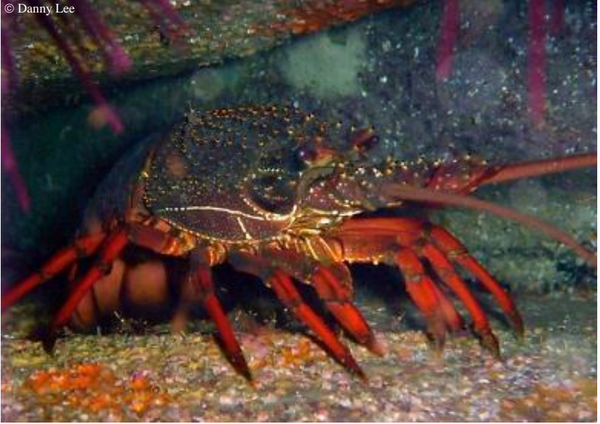
Plate 1. The eastern rock lobster ( Sagmariasus verreauxi ) is the most reported species on the Redmap website, observed in areas along the Tasmanian east coast that are not considered part of its historical range